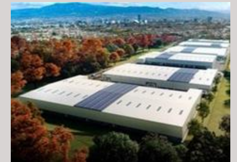
Industrial Park, La Verbena, 187,519 M2 Alajuelita, Costa Rica