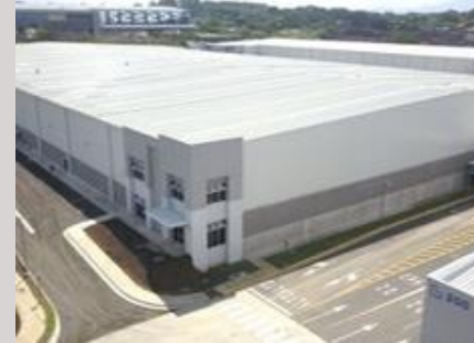
PriceSmart Logistics Warehouse, 15,592 M2, Coyoil, Costa Rica Latam Logistics Portfolio (8 Properties)