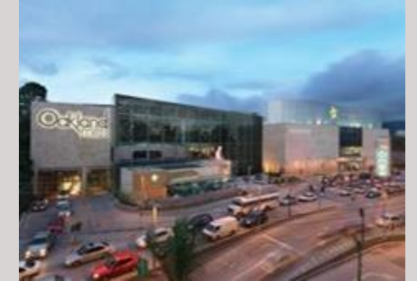
Oakland Mall, Guatemala City, Spectrum Mall Portfolio