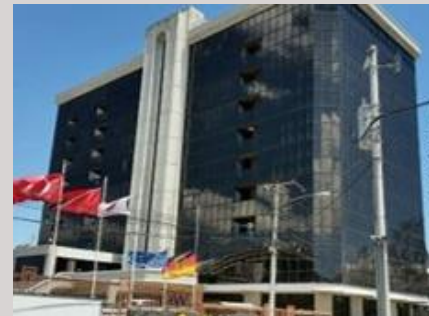
Torre La Sabana, 12,394 M2, San Jose, Costa Rica