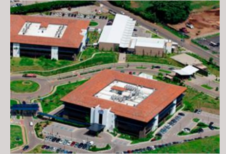
Centro Corporativo El Cafetal Office park, Heredia Mercado de Valores