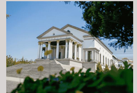
Ciudad Cayalá Master Plan Retail, office, residential Grupo Cayalá