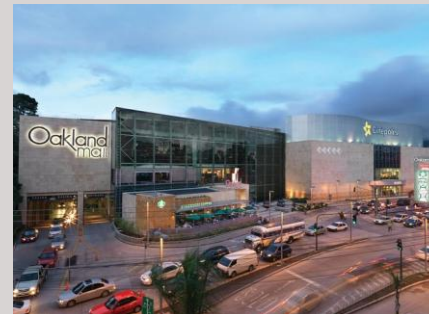
Shopping Center Portfolio 5 Super regional malls Spectrum