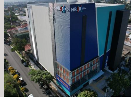
Mr. B Self Storage Portfolio Guatemala, Costa Rica, El Salvador