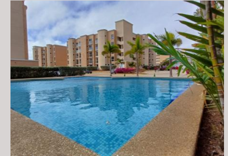
Residential Unit – Apartment Conjunto Residencial Casa Caribe Porlamar, Isla de Margarita