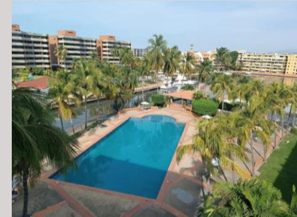
Residential Unit – Duplex Apartment Conjunto Residencial Plaza Marina Lecherías, Edo. Anzoátegui