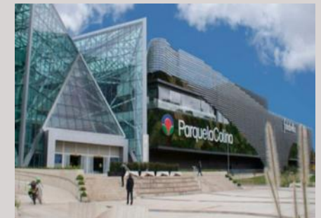
Portfolio of 8 Assets Super regional malls Parque Arauco Colombia