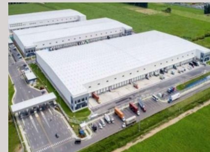
LatAm Logistics Industrial Park, Logistic Properties of the Americas Tenjo, Colombia